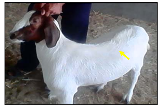
Fig. (1): Healthy Boer goat

iron deficiency that could be attributed to reduction of energy and protein intake due