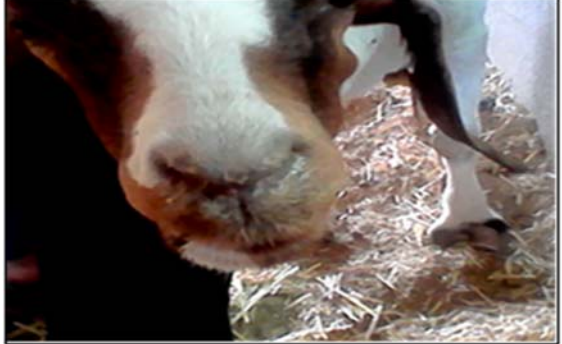
Fig (4): Nasal discharge with crusts formation around nasal orifice of pneumonic Boer goat.