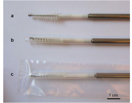
Figure 3. Cytobrush attached to metal rod (a) that was covered by a plastic catheter (b) and a plastic sleeve (c) (Wagener et al., 2017).

Currently, endometrial cytology is thought to be the most reliable method for determining if a cow has endometritis, both clinical and subclinical, based on the presence of cellular evidence of inflammation (Palmer, 2014). Kasimanickam et al. (2004) adapted the cytobrush (CB) by attaching it to a metal rod so that it could be used in bovine gynaecology. Similar to the artificial insemination (AI) procedures, a catheter protects the rod while it is transrectally inserted into the uterine body through the cervix. Wagener et al. (2017) demonstrated the shape of CB protected by catheter and plastic sleeve (Figure 3). According to Sheldon et al. (2009), the innate immune system is capable of recognizing bacterial infections that invade the uterus during the postpartum period, drawing inflammatory cells like neutrophils. A number of neutrophils in relation to endometrial cells becomes a sign of an inflammatory process and may be a significant feature of subclinical endometritis (Sheldon et al., 2009). Depending on the postpartum period, a threshold value of 5-18% is recommended for polymorphonuclear cells (PMN) as a diagnostic marker for subclinical endometritis (Wagener et al., 2017).