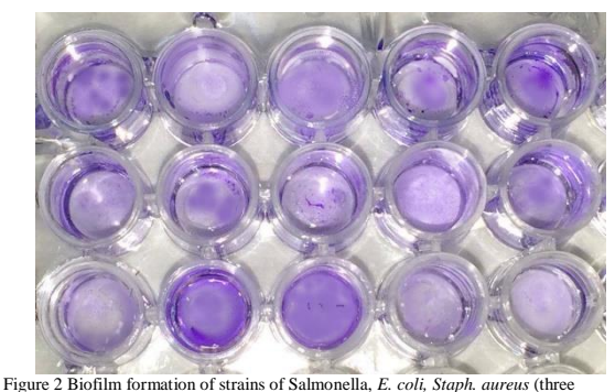
replicates) on polystyrene microtiter plate, the biofilm was stained with 0.1 % crystal violet in water. The intensity of blue color in each well indicates the potential of each strain to form biofilm under the specific conditions